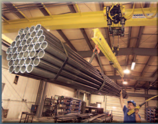
This mechanical bridge crane is used for safe and efficient material handling.