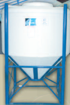
With rotational, injection and blow-molding production facilities on-site, Den Hartog Industries has the capabilities and experience to combine both metal and plastic parts into your finished product. Whether your project is simple or complex, our divisions can provide all the components you need to make it a success.