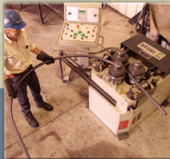
Rolling tubing to create a hoop.

Den Hartog Industries has the capabilities to offer many metal fabrication services that include sawing, shearing, shape cutting, piercing, punching, drilling and forming. We can roll metal sheets, channel, tube or pipe. Our years of experience and focus on quality provide you the expert workmanship you deserve.