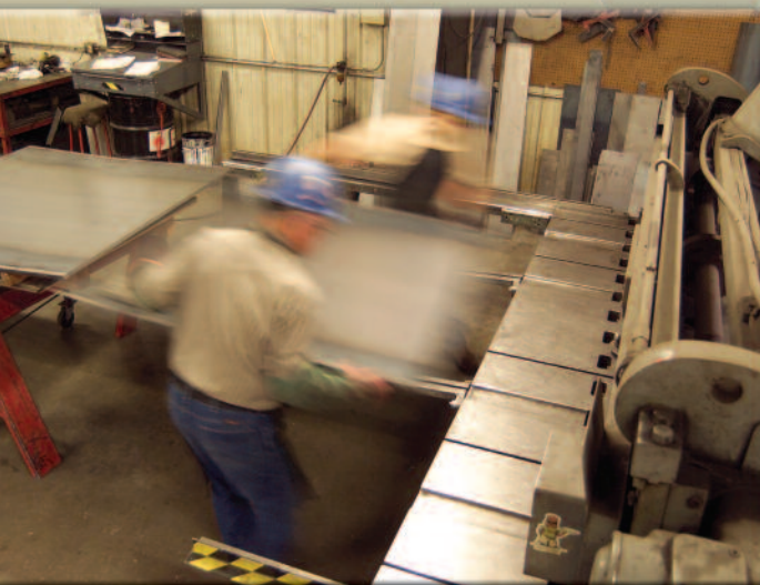
Shearing a sheet of metal.