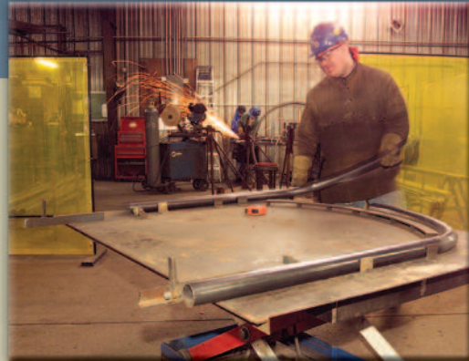
Quality assurance services are available to meet your specific standards. Process and testing results are documented and special templates are used to ensure products measure up to your requirements.