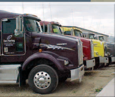
We offer shipping solutions to fit your budget and timeline. Whether you choose our fleet of trucks or another carrier, you can trust our scheduling staff to efficiently manage your shipments.