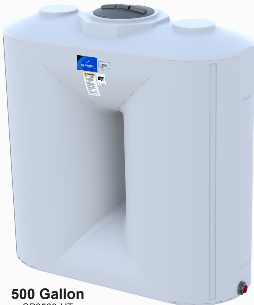
500 Gallon SP0500-UT

Den Hartog Industries, manufacturer of the ACE Roto-Mold Tanks announcing the addition of a new capacity of Slim-Line Utility Tanks to our product offering. The new 500 gallon model will be added to the current offerings of 250 gallon, 300 gallon, 400 gallon and 750 gallon, with a new rounded design for easy handling and placement. Designed for commercial or residential installations where a narrow designed tank is needed, able to fit through most doorways. Most commonly used for water storage where applications for drinking, irrigation, fire protection, or gardening may be needed.